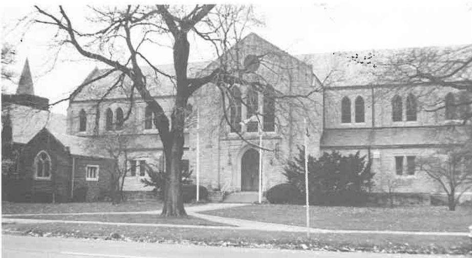
Trinity Cathedral, Trenton, N.J.