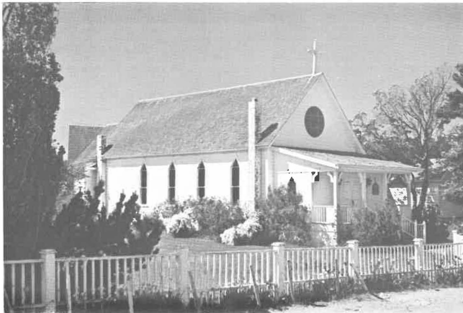
Emmanuel Church, Orcas Island, Wash.