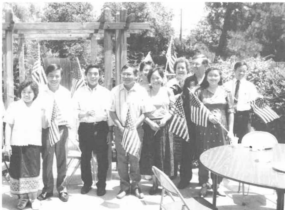
Members of St. Philip's Lao congregation celebrate U.S. citizenship, which they received earlier this year.

At a recent meeting in New Orleans, the administrative body of the Archdiocese of North and South America of the Greek Orthodox Church, voted, among other things, to give clergy and laity a voice in selecting members of the Archdiocesan Council, the highest governing body between biennial sessions of the congress. Appointments to the council had been the responsibility of the leader of the archdiocese, Archbishop Iakovos. The action was seen as an attempt to respond to an increasingly modern membership.