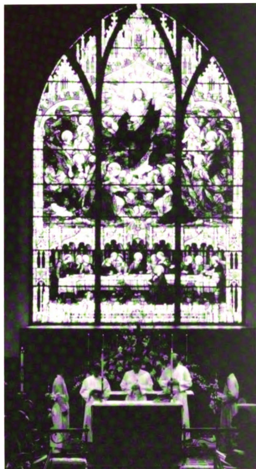
Holy Communion at Christ Church.