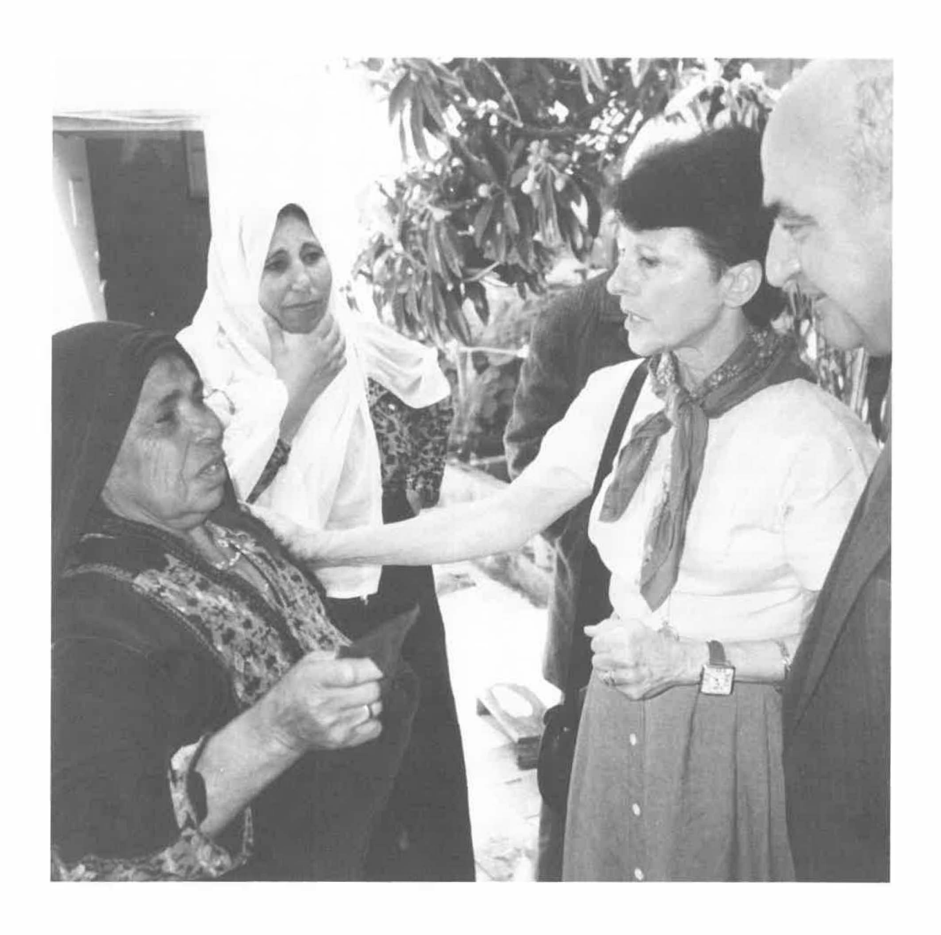
Visiting Palestinian Refugees