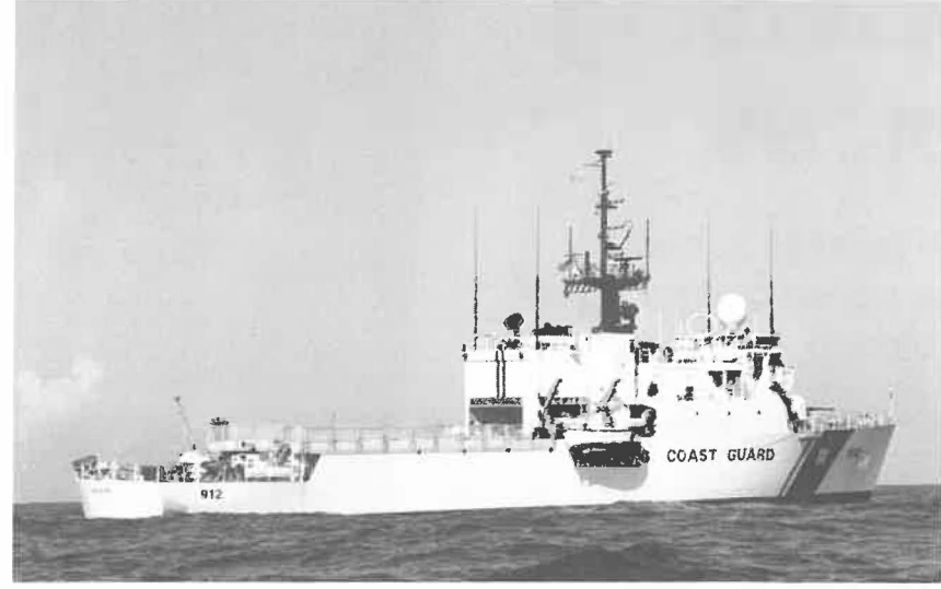
One of the United States Coast Guard cutters on watch for Haitian immigrants.

I have been a Naval Reserve chaplain for 11 years and have served in a variety of capacities with the Marine Corps and