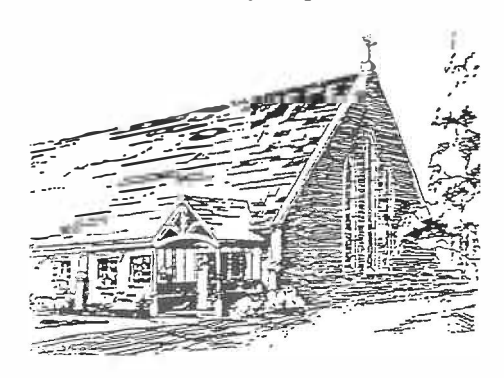
St. Luke's, Bladensburg, Md.

In a letter to the standing committee, the wardens wrote, "Why can't you just let us live out our days in peace? We don't